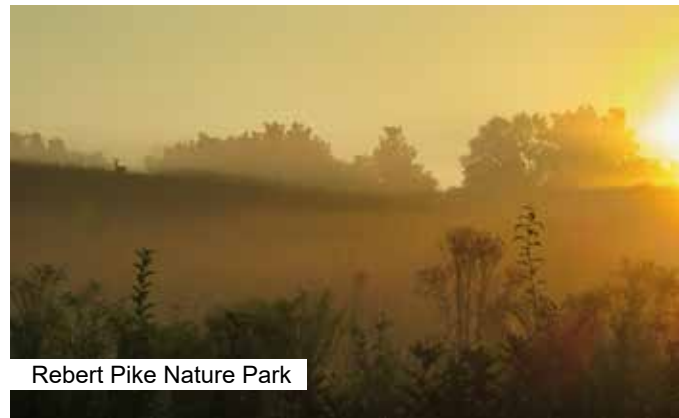
Rebert Pike Nature Park

Volunteer opportunities are also available for members of the community that want to support our park system. Volunteering allows for a flexible schedule and is a great way to earn service hours, gain experience and learn job skills. Volunteers must attend training sessions.