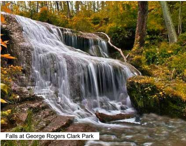
Falls at George Rogers Clark Park